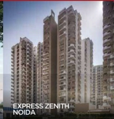
EXPRESS ZENITH NOIDA