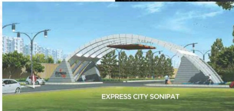
EXPRESS CITY SONIPAT